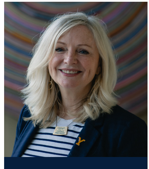
This funding helps to maintain our just, safe, and inclusive police service.

As Mayor of West Yorkshire, I oversee our police budget, which includes setting part of your Council Tax.